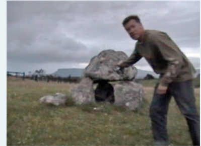
Carrowmore pagan stones circa 5000 B.C. County Sligo, Ireland.

He relied on the power of God to overcome pagan opposition. His ministry and life were earmarked with many power encounters and miracles. Over the course of his life he led over 100,000 people to Christ and established somewhere around 300 churches, in spite of stiff pagan opposition to his efforts.